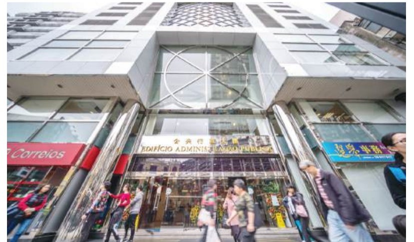
This handout photo provided by the Public Administration and Civil Service Bureau (SAFP) earlier this year shows the bureau's headquarters at the Public Administration Building in Rua do Campo.

The results from the exam will be valid for a period of five years, with those who passed being able to then submit applications to specific job offerings in the government's different departments. Among those are specialists, clerical staff, and interpreters/translators, among others.