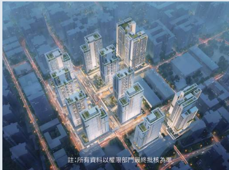
This artist's rendition released by Macau Urban Renewal Limited (MUR) on Friday shows the future high-rise buildings in its Iao Hon Estate redevelopment project.

The statement said that the company has collected signatures from most of the Iao Hon Estate's condominium owners and is actively contacting condominium owners who are currently outside Macau, with the aim of getting the estate's redevelopment off the ground. ■