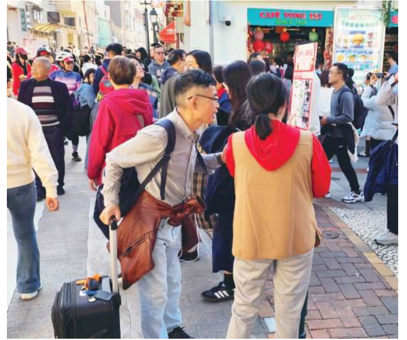
This undated handout photo provided along with a joint statement by the Economic and Technological Development Bureau (DSED), Transport Bureau (DSAT), Public Security Police (PSP), Macau Government Tourism Office (MGTO) and the Municipal Affairs Bureau (IAM) shows visitors walking around the “Old Taipa” pedestrian precinct during the Chinese New Year holiday in early February this year.

A joint statement and press conference by the Economic and Technological Development Bureau, Transport Bureau (DSAT), Public Security Police (PSP), Macau Government Tourism Office (MGTO) and the Municipal Affairs Bureau (IAM) quoted Tai as saying that the temporary pedestrian precinct set up during