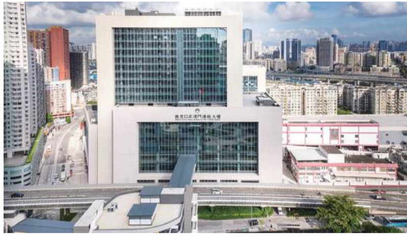
This file photo downloaded from the Public Security Police's (PSP) website yesterday shows the Qingmao checkpoint building in Ilha Verde.

A DSOP statement on Friday noted that with the V-shaped area's