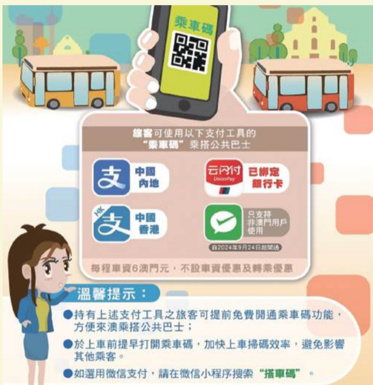
This poster provided by the Transport Bureau (DSAT) on Saturday promotes the newly accepted payment methods for the city's public bus.

The bureau will keep a close eye on the effectiveness of the newly added payment methods, and continue to coordinate the introduction of other payment methods, in order to further facilitate the travelling convenience for residents and tourists, the bureau added. ■