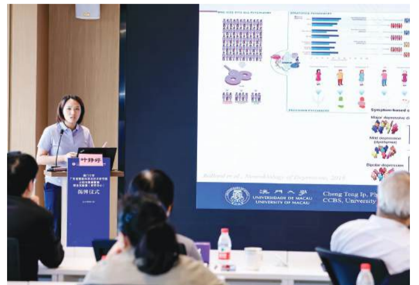
This undated handout photo provided by the University of Macau (UM) on Friday shows the academic seminar on “Cognition and Brain-inspired Intelligence” taking place recently.

An academic seminar on cognition and brain-inspired intelligence was also held on the same day, said the statement, which did not say when and where the seminar took place. ■