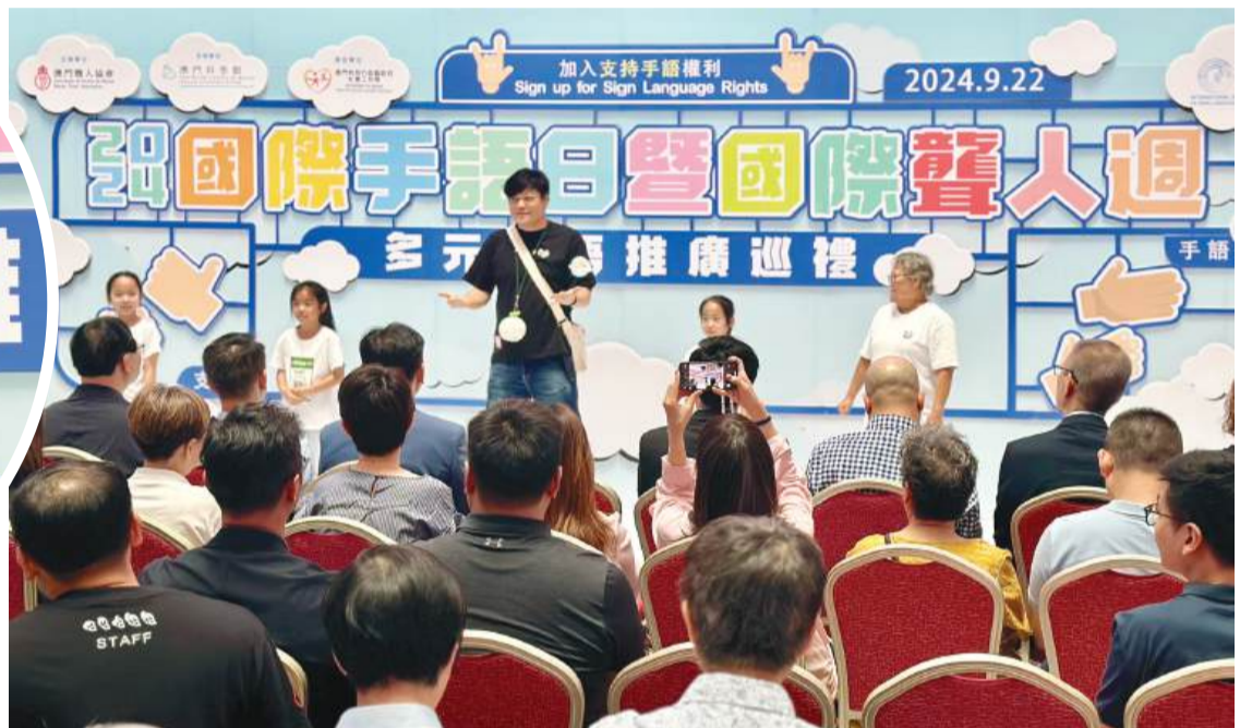
Hearing-impaired amateur actors perform a theatre play on the sidelines of yesterday's ceremony.

out that there was a growing demand for information and visual accessibility facilities for the hearing impaired, adding that her association received last year the referral of about 10 newborns: “In the past, most of the services targeted at the deaf were to assist them in handling matters such as government applications and medical conditions. However, nowadays, their demand for receiving information is increasing, and not all channels of information are equipped with sign language and subtitles, so there is still a lack of sign language interpreters in terms of the growing demand for their services.